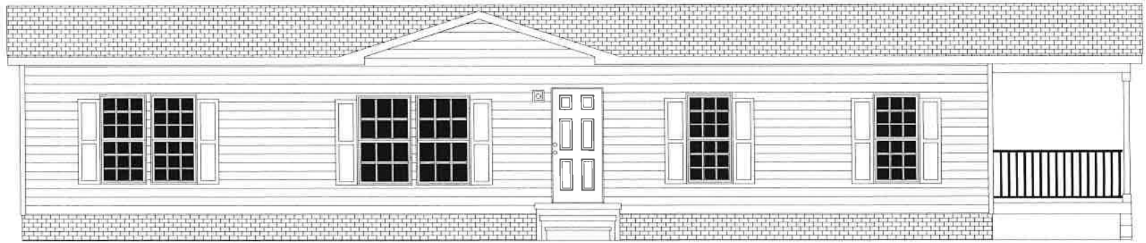
NOTE: ELEVATION SHOWN WITH OPTIONAL 8'-0" PORCH